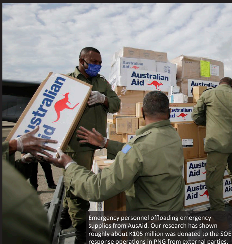
Emergency personnel offloading emergency supplies from AusAid. Our research has shown roughly about K105 million was donated to the SOE response operations in PNG from external parties.

Stay tuned to our website and social media pages (Facebook, Twitter) for further details on phase two.