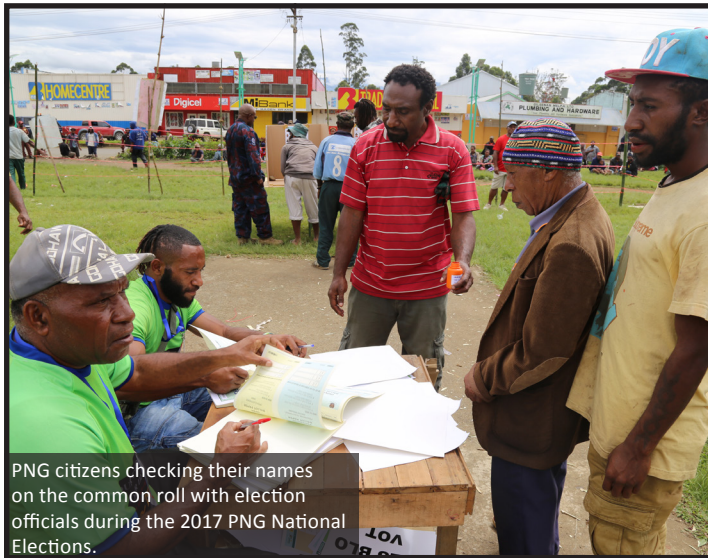
PNG citizens checking their names on the common roll with election officials during the 2017 PNG National Elections.

After we observed gross violations of voter rights protocols during the 2017 National General Elections, we have now embarked on a new partnership with the Electoral Commission of PNG (ECPNG), in an effort to raise awareness in PNG communities about voter rights and election process as a whole.