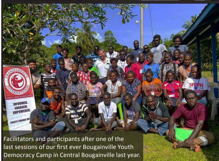
Facilitators and participants after one of the last sessions of our first ever Bougainville Youth Democracy Camp in Central Bougainville last year.